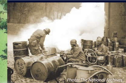
African-American soldiers lay a smoke screen to cover action over the Saar River.

At the cemetery's east end the ground rises to a knoll with the overlook. From it, one views the entire cemetery and the countryside for miles to the west.