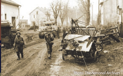
U.S. soldiers pursue German forces on the outskirts of Metz.