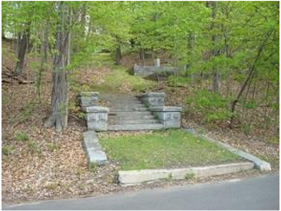
Dyer Cemetery Summer of 2016