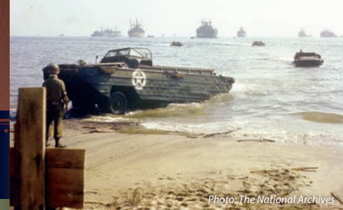
Amphibious trucks (DUKWs) bring supplies to a landing beach in Southern France, August 1944.

KEY: † Military Cemetery 🪂 Parachute Drop