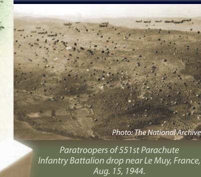
Paratroopers of 551st Parachute Infantry Battalion drop near Le Muy, France, Aug. 15, 1944.

The graves area is divided into four plots surrounding the oval center pool. Olive trees among the 860 headstones lend an unforgettable peacefulness to the scene.