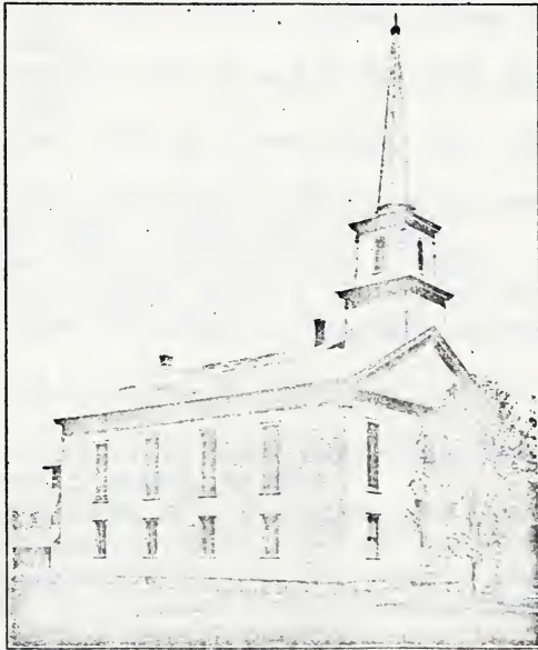
THE BAPTIST CHURCH