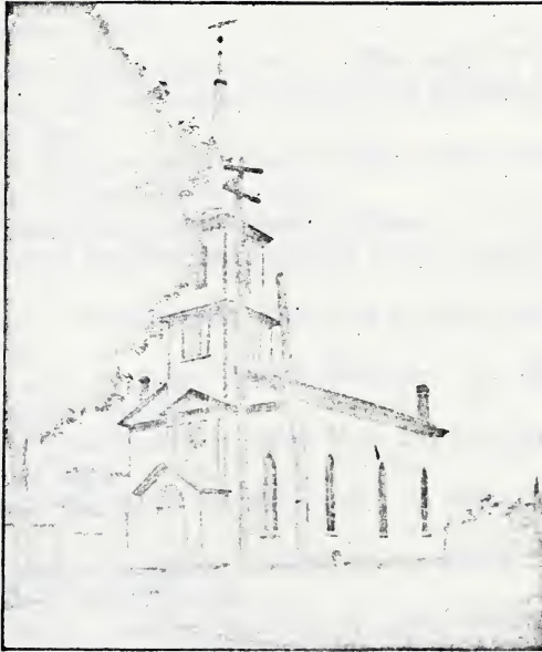
THE METHODIST CHURCH